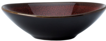
L6753074942 RUSTIC CRIMSON DISH 2 OZ