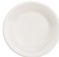
R4898998118 CHORD TENOR FLAT PLAT 6.5 IN