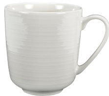
R4898998561 CHORD TENOR MUG 12 OZ