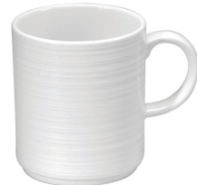
R4570000531U UNDECORATD BOT UNO CUP STACK 9 OZ