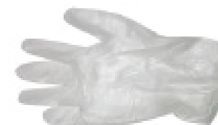
PEG-M, PEG-L POLYETHENE GLOVES, MEDIUM, LARGE