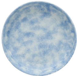
F1463060283 STUDIO POTTERY CLOUD TAPAS DISH 5 IN