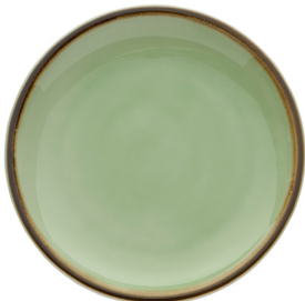
F1463067115 STUDIO POTTERY CELADON PLATE 6 IN