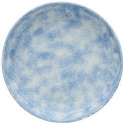
F1463060291 STUDIO POTTERY CLOUD TAPAS DISH 7 IN