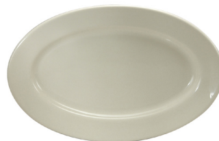
F1500002391 L 609 GRN ROL PLATTER 15 1/2