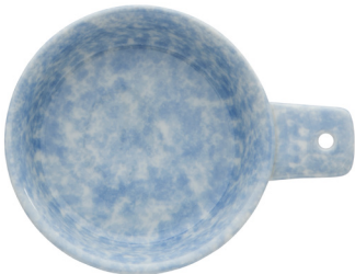
F1463060108 STUDIO POTTERY CLOUD TAPAS SNGL HNDL 5IN