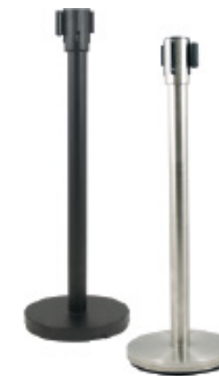
RS-36BK/N, RS-36SS/N 36" STANCHION W/6½" RETRACTABLE BELT, 12" BASE