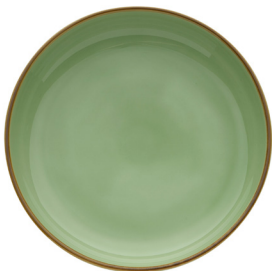
F1463067291 STUDIO POTTERY CELADON PLATE 6 IN