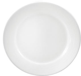
R4570000127 UNDECORATD BOT PLATE 7 1/4IN