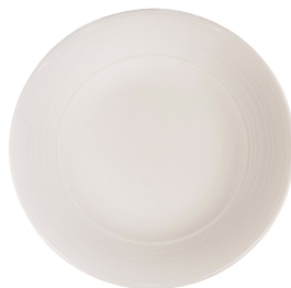
R4898998155 CHORD TENOR FLAT PLATE 11 IN