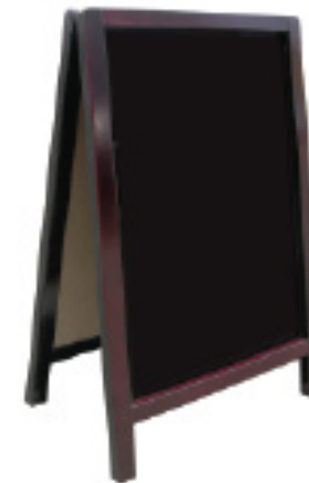
ASIGN-2034 2 SIDED WRITE-ON BOARDS W/ 4 MARKERS