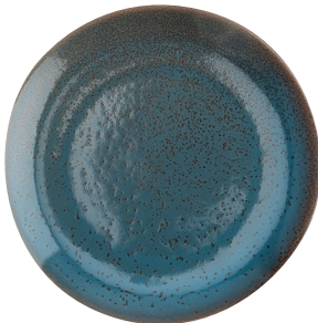
F1493020123 TERRA VERDE DUSK PLATE 7 IN