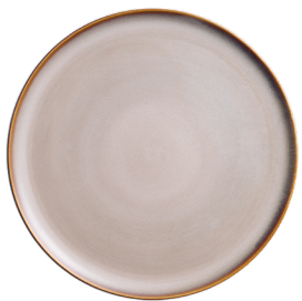
L6753066123P RUSTIC SAMA PLATE 7 IN