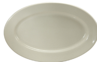
F1500001391 L 108 GRN ROL PLATTR 15 1/2IN