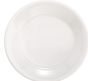
R4898998134 CHORD TENOR FLAT PLATE 8.3 IN