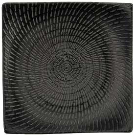
L6250000123S UNDECORATED URBAN BLK CURVE SQ PLT 7 IN