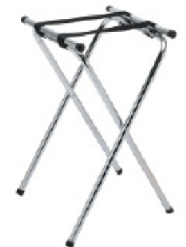
TSC-31, TSC-37 CHROME PLATED TRAY STAND 31"H, 37"H