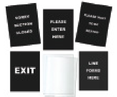
RS-SF/BK STANCHION TOP SIGN FRAMES & SIGNAGE, 8¾"X12"