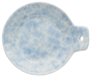
F1463060283 STUDIO POTTERY CLOUD TAPAS DISH 5 IN