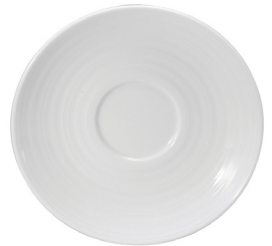
R4570000500 UNDECORATD BOT SAUCER 6IN