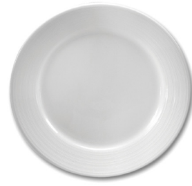
R4570000149 UNDECORATD BOT PLATE 10 1/4IN