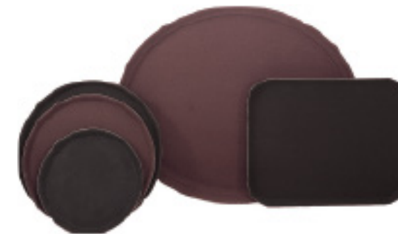
NON-SLIP SERVICE (BAR) TRAYS ROUND, OVAL, RECTANGLE BROWN, BLACK