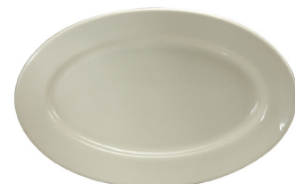
F1500001359 L 108 GRN ROL PLATTR 11 1/2IN