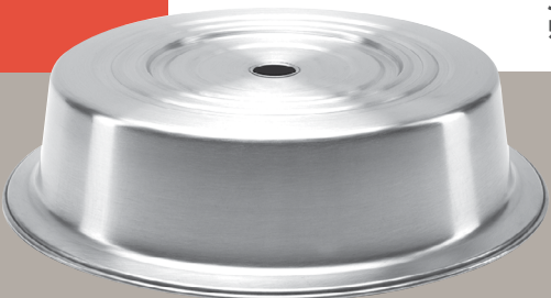
J0093041AQC 5 CROWN PLATE COVER

Oneida's durable plate covers feature a brush finish and are specifically designed and constructed for high-volume use. Plate covers give your guests confidence that their food has been fully protected between the buffet and their table.